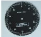
Long Range Caliper Dial Face Part Number: 05-100-107 Note: Compatible with both 18 and 24 inch versions.