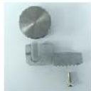
Thumbwheel Assembly for 52-008-024 Part Number: 05-100-429