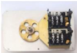
Twin Beam Counter Mechanics Part Number: 05-100-307