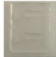
Twin Beam Clear Counter Cover Part Number: 05-100-310