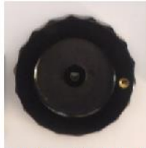
Twin Beam Handwheel Part Number: 05-100-306