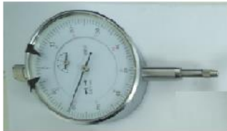
Xtender Inch Indicator 0.0001" Part Number: 02-646-500