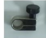
Xtender Clamp w/ Screw Part Number: 05-100-263