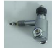
Xtender 2-6" Measuring Head Part Number: 05-100-261