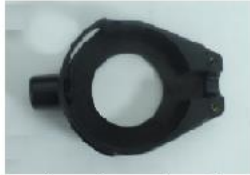
Xtender Indicator Shroud Part Number: 05-100-265