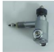
Xtender 2-6" Measuring Head Part Number: 05-100-261 Note: Not compatible with 52-646-500. Note: Compatible with 50-160mm Metric Extender units.