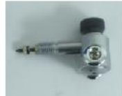
Xtender 1.4-2" Measuring Head Part Number: 05-100-262 Note: Compatible with 35-50mm Metric Extender units.