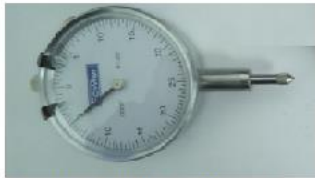
Xtender Inch Indicator 0.0005" Part Number: 02-646-300