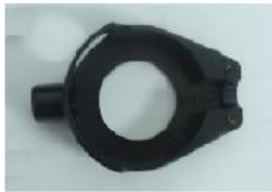
Xtender Indicator Shroud Part Number: 05-100-265