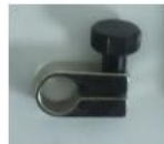
Xtender Clamp w/ Screw Part Number: 05-100-263