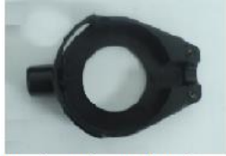
Xtender Indicator Shroud Part Number: 05-100-265