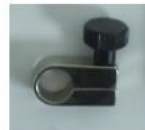
Xtender Clamp w/ Screw Part Number: 05-100-263