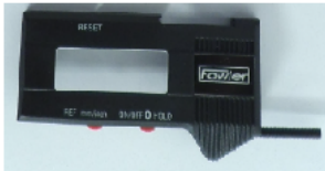
Heavy Duty Caliper Cover 12" Part Number: 05-100-106 Note: Only compatible with 12" Ultra-Cal III Heavy Duty calipers.