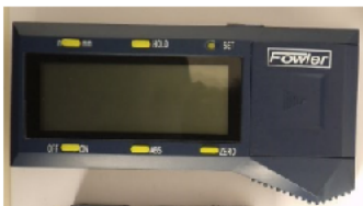
Xtra-Range 40" Display (New)

Note: Compatible only with all yellow button versions.