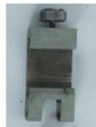
Adjustment Slider 12" (New)

Note: Compatible only with new Xtra-Range displays, not compatible with one reb button versions.