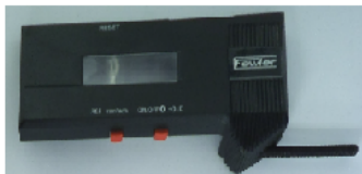
Heavy Duty Caliper Cover 40" Part Number: 05-100-110 Note: Only compatible with 40" Ultra-Cal III Heavy Duty calipers.