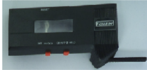
Heavy Duty Caliper Cover 20" Part Number: 05-100-105 Note: Only compatible with 20" Ultra-Cal III Heavy Duty calipers.